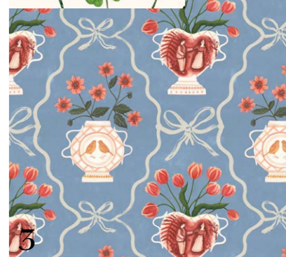
Romantic Vase wallpaper, $263*/10m roll, Polly Fern.